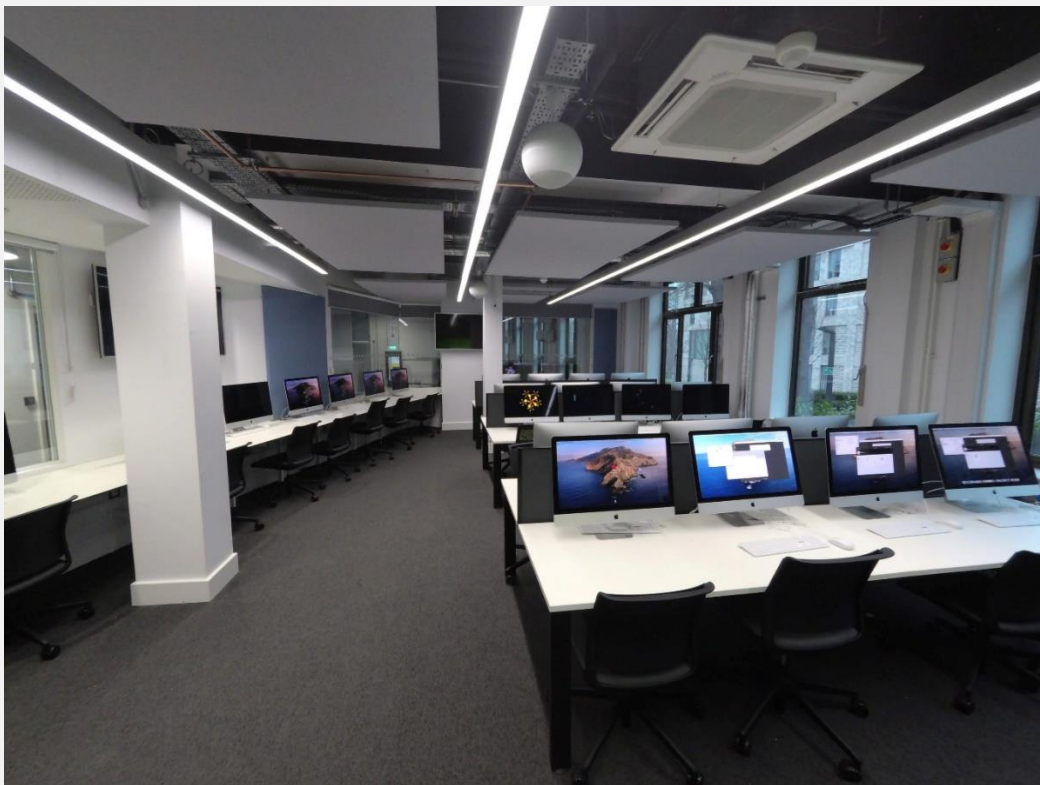
Computer Suite

Sandy Brown were engaged in the project to ensure that students will receive industry standard amenities. The project team developed the acoustic design strategy for the scheme and provided tender specifications for the building envelope, internal sound insulation for separating floors, walls and doors, reverberation and room acoustics, as well as building services noise and vibration.